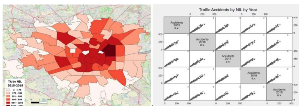
Figure 1 – Choropleth map of traffic accidents with casualties. Milan municipality: 2015 to 2019. Partition: 88 NIL.

Figure 2 shows the TA distribution in the 88 square cells of the specially-made geometric grid covering the Milan territory. One can notice that in this case, too, the TA spatial distribution is uneven. Table 3 shows that the average std dev. of the TA over the five-year span is, in the case of the geometric grid, even higher than that for the NIL (Table 2). Concurrently, the Alpha coefficient for the 88 cells is higher than the NIL one. The loadings std dev. is slightly higher while the KMO measure is slightly lower. All in all, these findings prove that the differential in TA between the territorial units and the over-time consistency of the TA spatial distribution do not depend on the administrative nature of subdivisions such as the NIL.